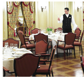
Victoria & Albert Ballroom