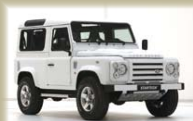
LAND ROVER DEFENDER 90