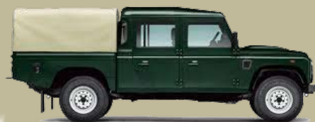
LAND ROVER DEFENDER 130

The Canadian Landrover Experience is guaranteed to run through sleet and snow, hail and hard terrain. The worse the weather gets, the better for this action-based, hardy program.