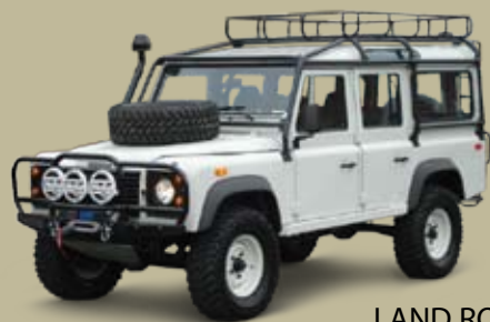
LAND ROVER DEFENDER 110