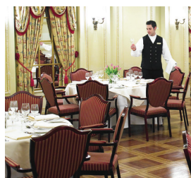
Victoria & Albert Ballroom